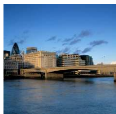
Panoramic shot of the Berwin Leighton Paisner building

As document expertise became more important to law firms, she naturally gravitated to the IT role and two decades passed happily until she understandably grew